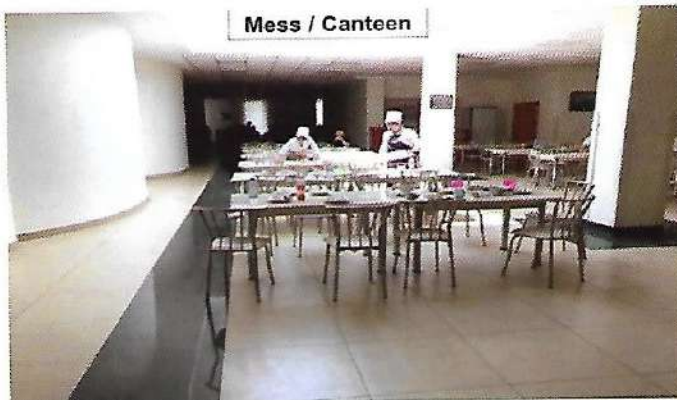
Mess / Canteen